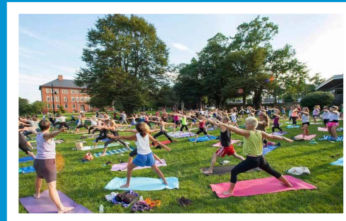
Hyannis Village Green

Indoors and out, there is always something going on, in and around town. From free yoga classes to concerts, festivals, theater, dance and more, find something to do every day of the year.