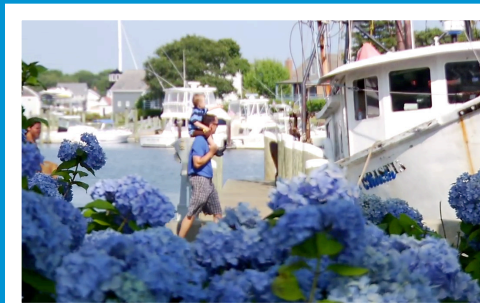
Artist Shanties, Hyannis Harbor

Take a seaside stroll along Hyannis Harbor and the artist shanties and working water front. You are never far from scenic water views in all seven villages.