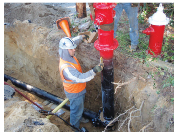
Replacement of a deficient fire hydrant