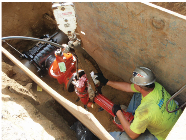
The tapping of a water main

The two major capital improvement projects in 2014 for the Hyannis Water System dealt with the distribution system. A cleaning and lining water main project on Camp Street and Mary Dunn Way rehabilitated a 1911 water main and a water main replacement project upgraded pipe and resolved a dead-end situation in the Cook Circle and Highland Street area of Hyannis.