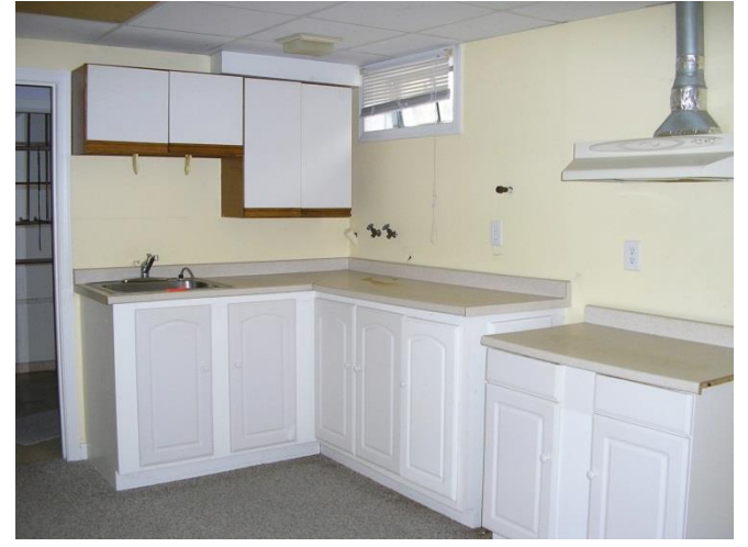
Residential Kitchen - Inspections