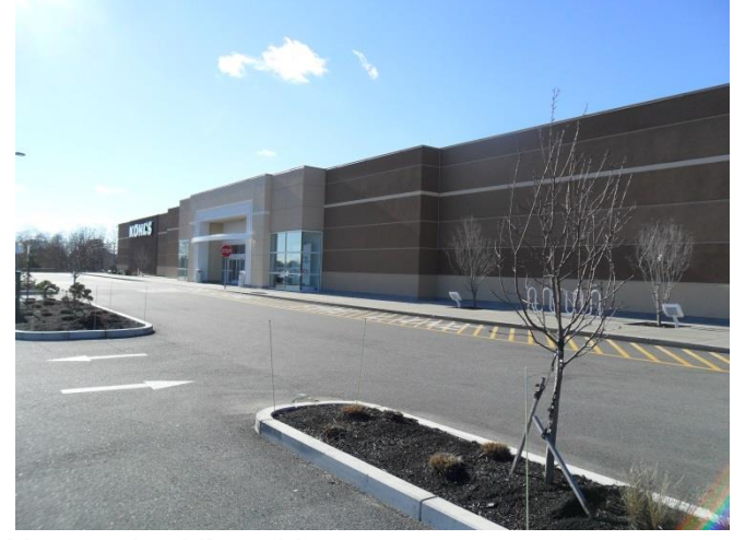
New Building Growth – Fairfield Inn and Kohl's Building

Helping To Ensure Public Safety and Quality Of Life Page 299