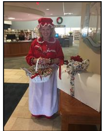
Mrs. Claus at Stroll