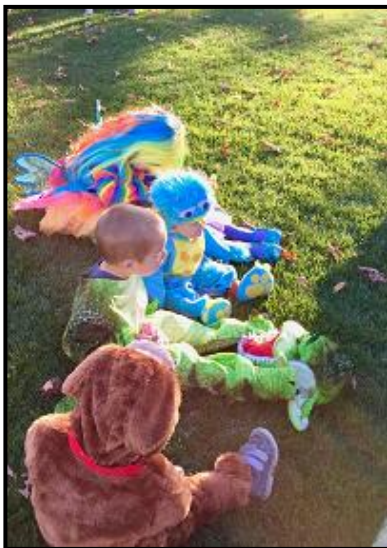
Halloween Parade Aftermath