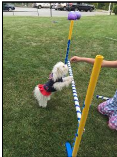
Mutts and Martinis