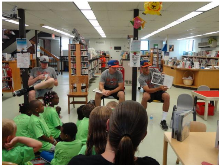
Hyannis Harbor Hawks Reading to Admirers in Library