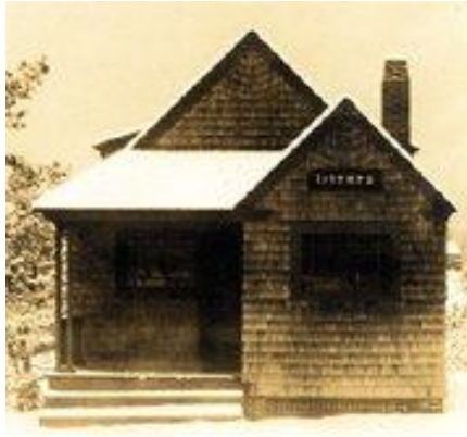
Original Marstons Mills Library