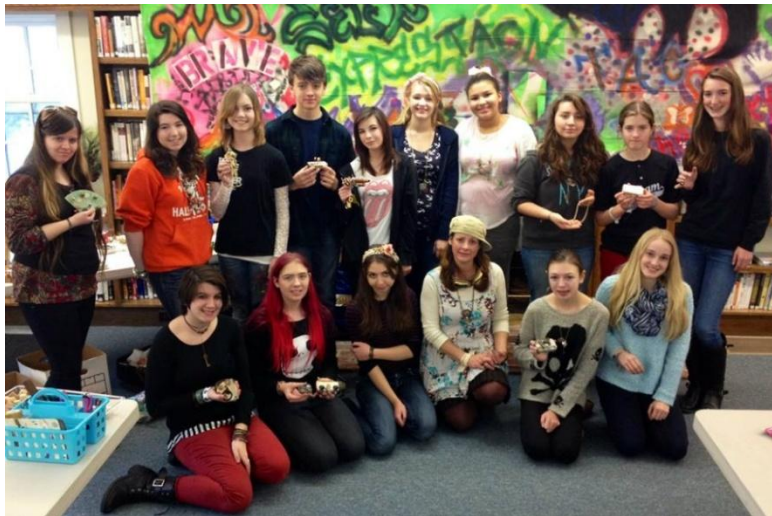
Library Teen Artists Coalition