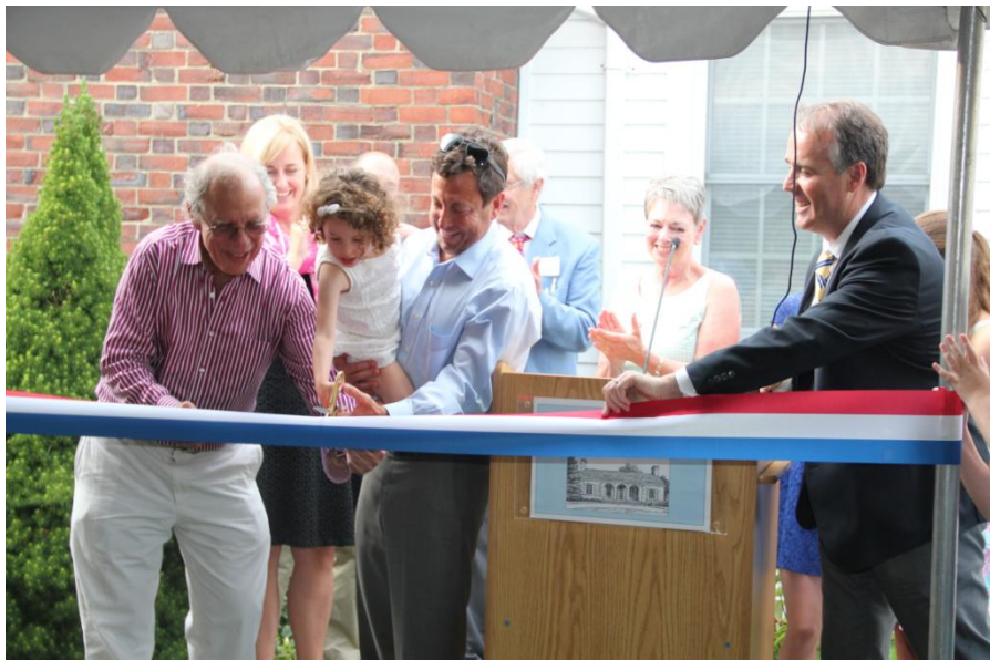
Dedication Ribbon Cutting