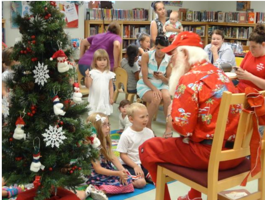
Santa's Visit to Hyannis Library in July