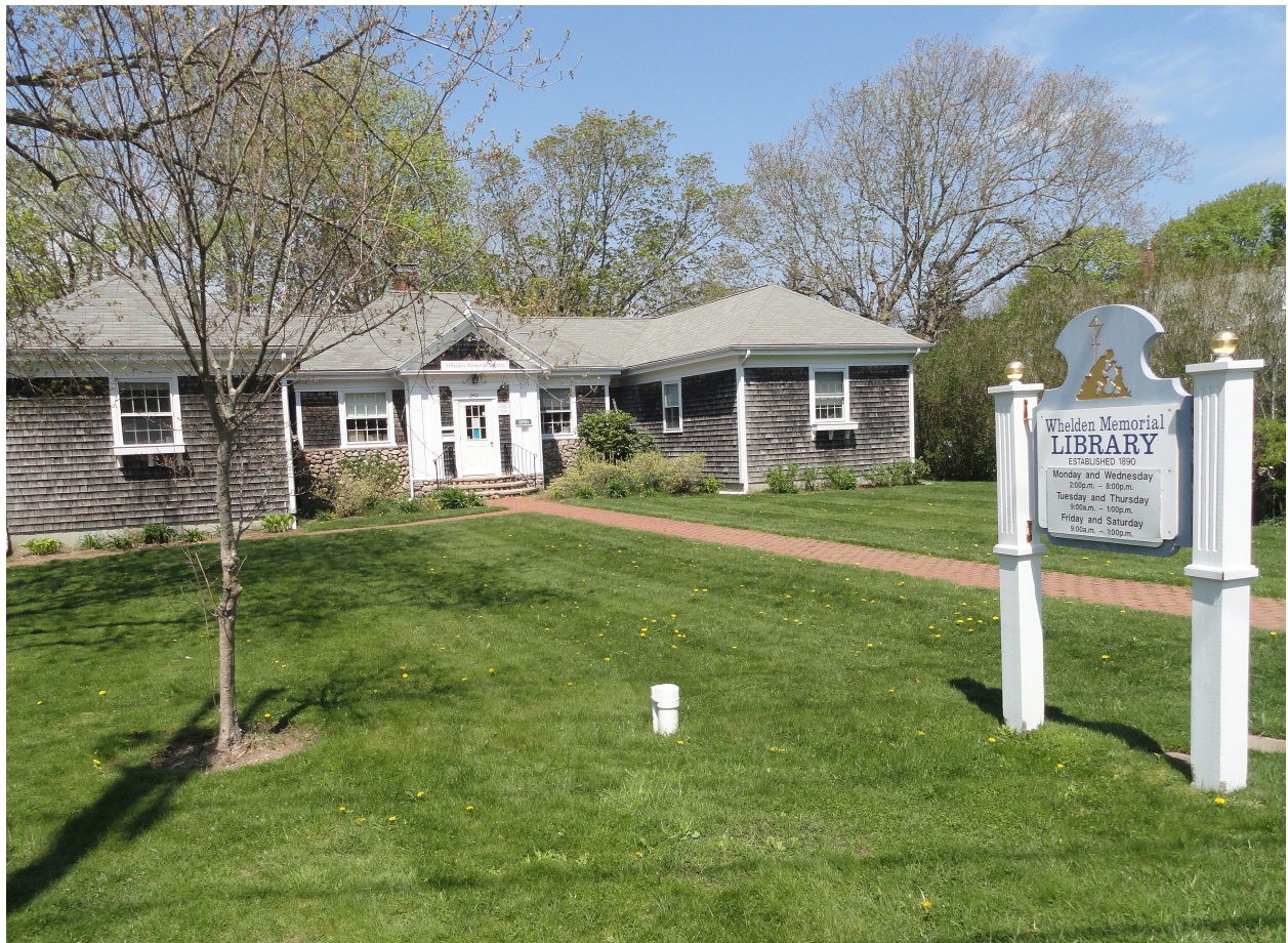
Whelden Memorial Library